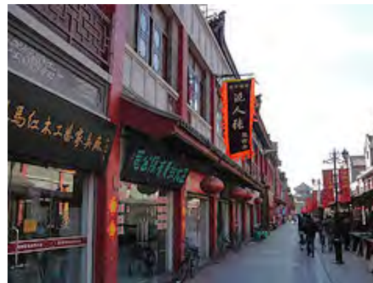
Old Culture Street, Tianjin