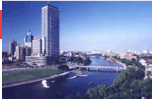
Haihe River, Tianjin