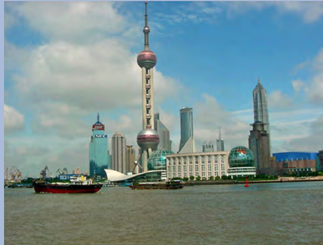
Pudong New Area, Shanghai

Located 110 kilometers from Beijing, a half-hour ride by the bullet train, Tianjin is the third largest city in China, with an area of 11,000 square kilometers and a population of 12 million residents. The people of Tianjin are well known for their hospitality, generosity and colorful customs. The city is the industrial and commercial center in the region and boasts the biggest comprehensive port in north China. In 2006 the central government approved an ambitious plan to build Tianjin Binhai New Area—about four times bigger than Shanghai's futuristic Pudong New Area—into a third economic powerhouse after Shenzhen and Pudong of Shanghai.