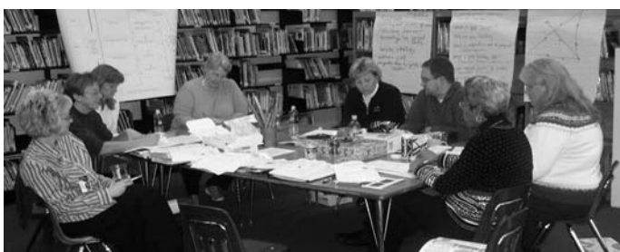
OCCMSI Members of Elmwood Place Elementary School Improvement Team